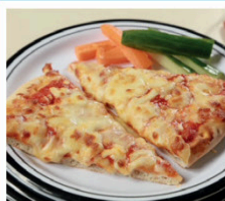
2 Slices of Thin & Crispy Cheese & Tomato Pizza (V), served with Baked Beans, Seasonal Vegetables or Coleslaw