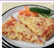
2 Slices of Thin & Crispy Cheese & Tomato Pizza (V), served with Baked Beans, Seasonal Vegetables or Coleslaw