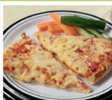
2 Slices of Thin & Crispy Cheese & Tomato Pizza (V), served with Baked Beans, Seasonal Vegetables or Coleslaw