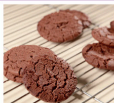
Chocolate Mudslide Cookie