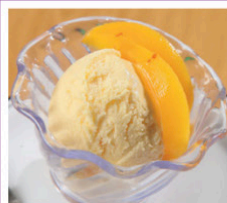
Vanilla Ice Cream & Fruit