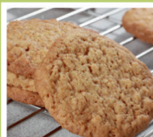
Rice Crispy Cookie

For allergen information, please ask one of our catering team • All the above dishes are subject to availability