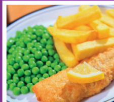
Battered Fish served with Chips, Baked Beans or Peas