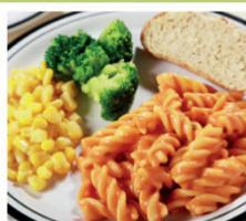
Tomato & Mascarpone Cheese Pasta (V) served with Crusty Bread & Seasonal Vegetables