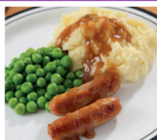
Sausages served with Mashed Potato, Gravy & Seasonal Vegetables