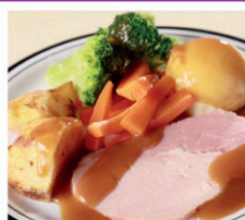
Roast Gammon Lunch served Roast/Mashed Potatoes, Seasonal Vegetables & Gravy