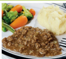
Minced Beef in Gravy with Mashed Potato & Seasonal Vegetables