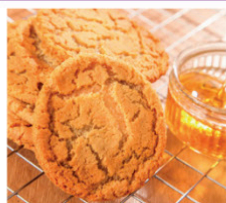
Golden Crunch Biscuit