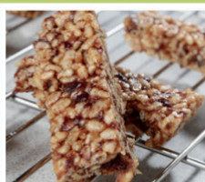
Caramel Crispy Bar