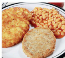
Sausage Pattie Brunch served with Hash Browns & Baked Beans