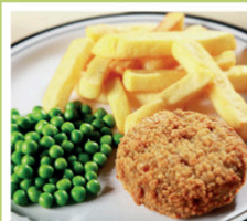
Fishcake served with Chips, Baked Beans or Peas