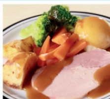
Roast Gammon Lunch served Roast/Mashed Potatoes, Seasonal Vegetables & Gravy