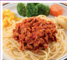
Spaghetti Bolognese served with Seasonal Vegetables