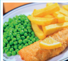
Battered Fish served with Chips, Baked Beans or Peas